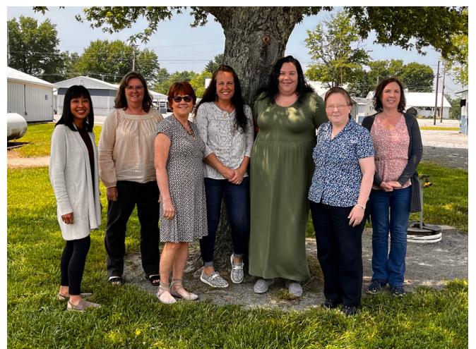
CLERMONT COUNTY LOCATION