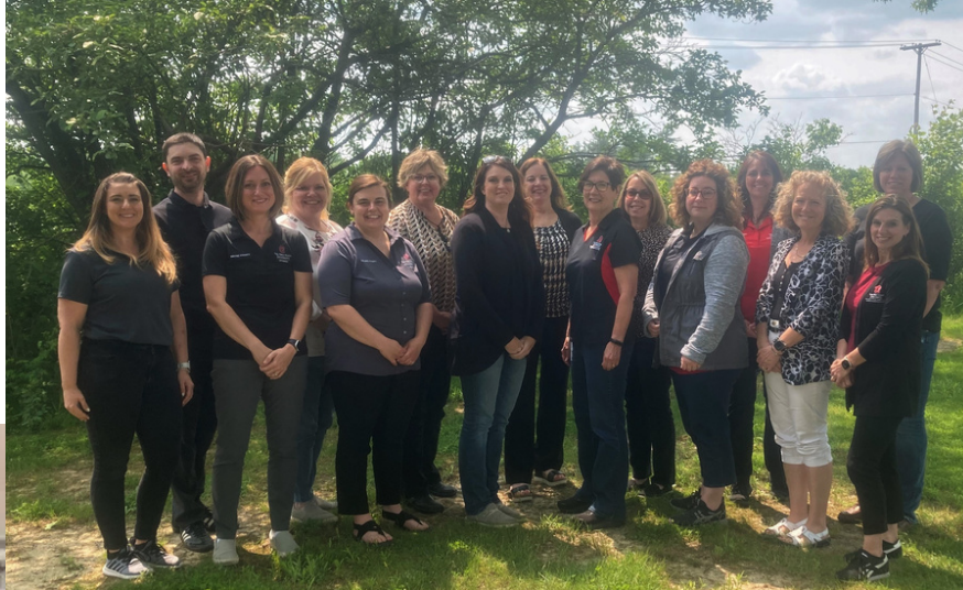
MAHONING COUNTY LOCATION