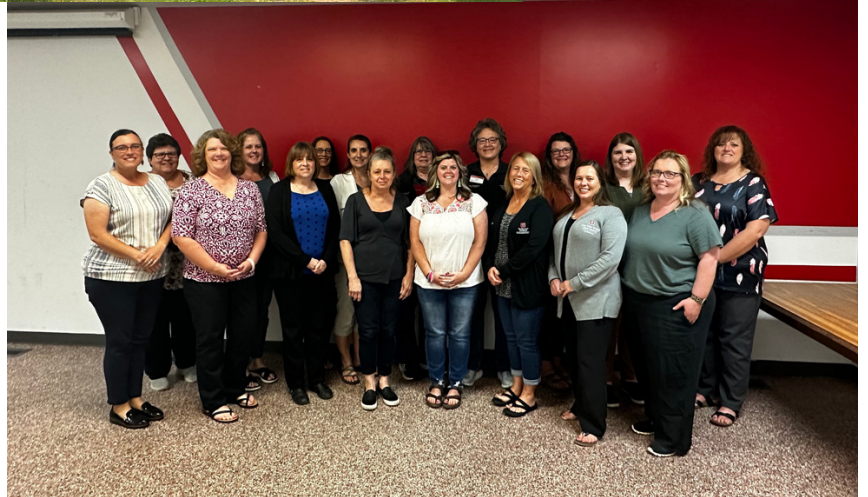
JACKSON COUNTY LOCATION