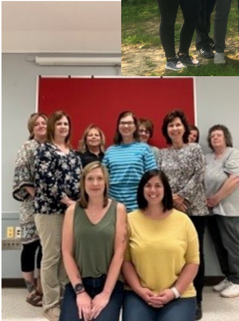
OPERATIONS - CALDWELL