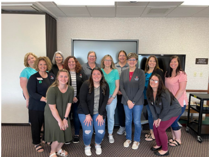
DEFIANCE COUNTY LOCATION