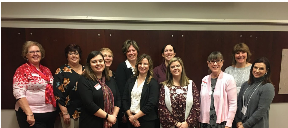
2019 CES Officer Team