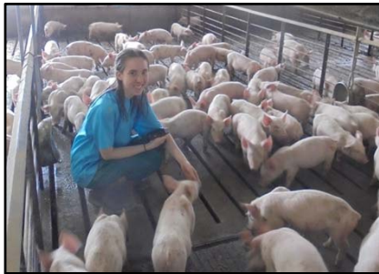
Figure 1. Collecting photo and video media.